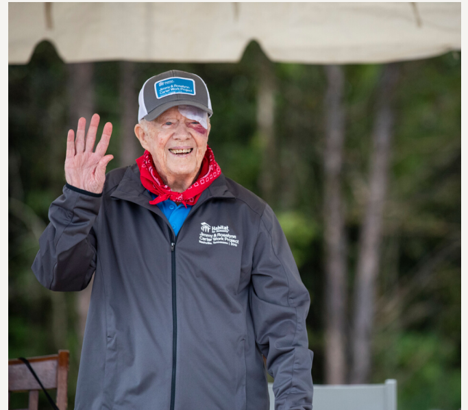
Former President Jimmy Carter begins work at a future Habitat for Humanity home in Nashville.

The Carters were warmly welcomed to Nashville by Trisha Yearwood and Garth Brooks, who built at the Carter Work Project for their 12th year. They first volunteered together with Habitat in 2007 in New Orleans to help build post-Katrina Habitat homes on the Gulf Coast, and since then, have lent their names and support to numerous Habitat events and projects. Along with the Carters, Yearwood and Brooks were recognized as Habitat Humanitarians in 2016. Since beginning their work with Habitat for Humanity in 1984, just years after leaving the White House, President and Mrs. Carter have helped to build, renovate and repair 4,331 homes in 14 countries alongside more than 103,000 volunteers.