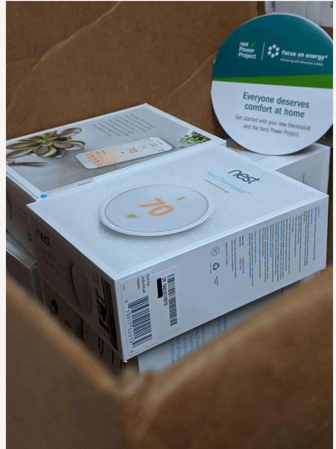
Box of Google Nest thermostats, provided by Focus on Energy

Currently, through the program we are offering income qualified homeowners in our service area the opportunity to replace their current thermostat with a new Google Nest thermostat at no charge. Applicants need to provide proof of income, proof of homeownership, and complete an application. Once verified, applicants will schedule a date to have their current thermostat replaced with the Nest. Those who are interested can print out an application online or call 715-553-0467 to have one mailed to them.