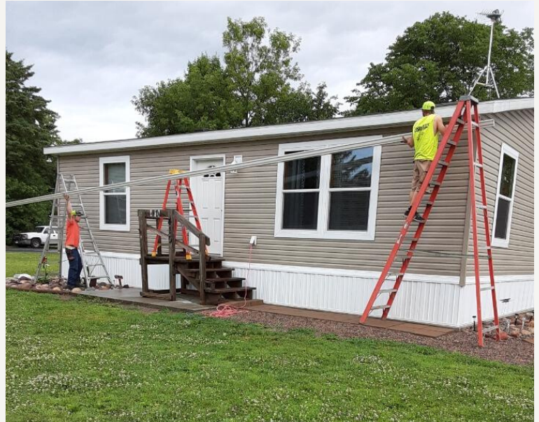
North West Gutters came out to help attach gutters onto this home. Thank you!