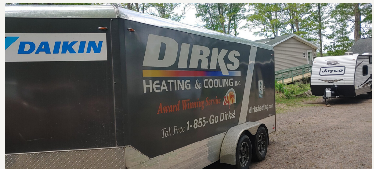
Thank you Dirks Heating & Cooling Inc. for coming out to replace the old furnace!

Wild Rivers Habitat for Humanity has been completing home repair projects whenever possible. During these times of sheltering in place, it's more important than ever that people have a safe place to call home. In June, we completed a number of home repairs in Washburn, Burnett and Polk County, including: a furnace replacement and a deck repair, a roof repair, an exterior paint job, and a gutter install.