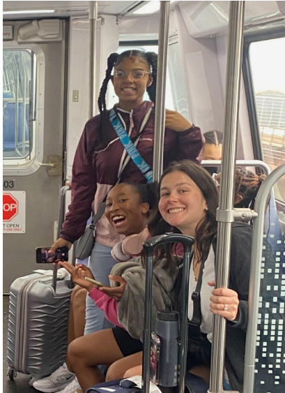
Nativity students enjoying a ride on the Washington Metro