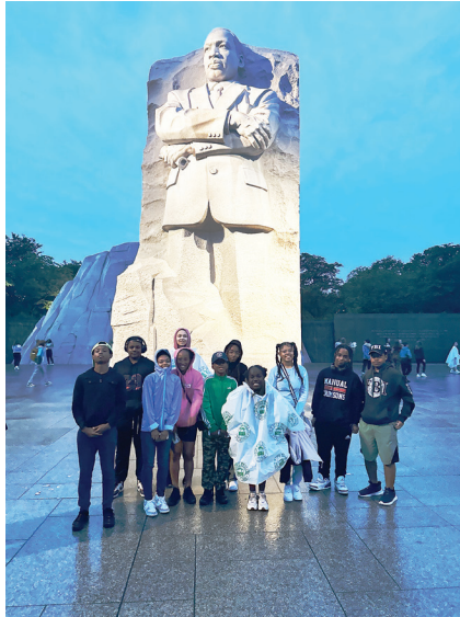
Eighth-grade students gather at the Martin Luther King, Jr. Memorial