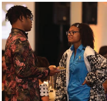
Nativity alumni attending the Auction

Working together, they all made this year's Nativity Academy Auction the most profitable fundraising event to date!