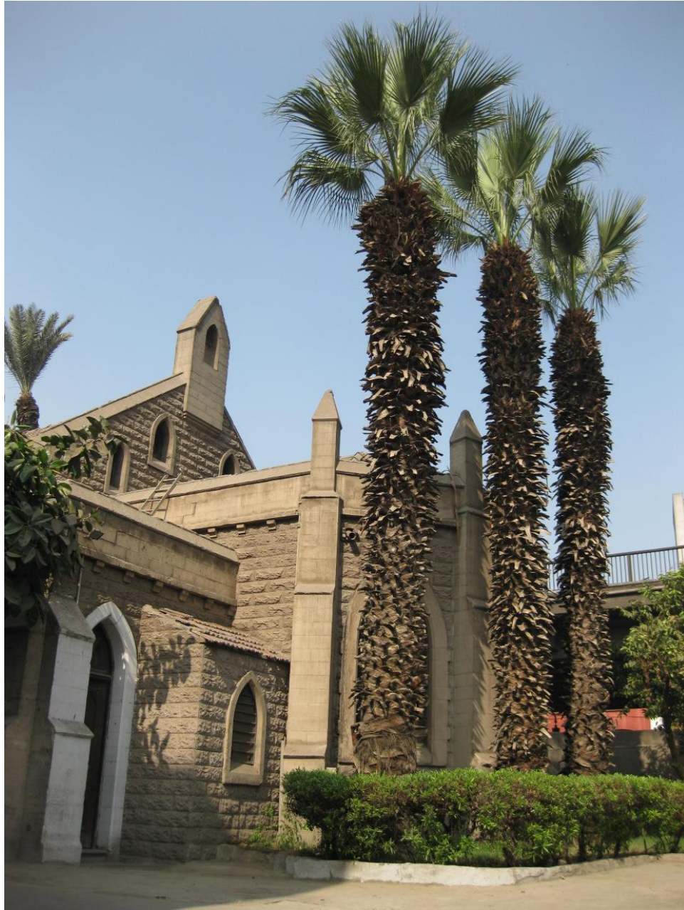
St. Andrew's Church, Cairo