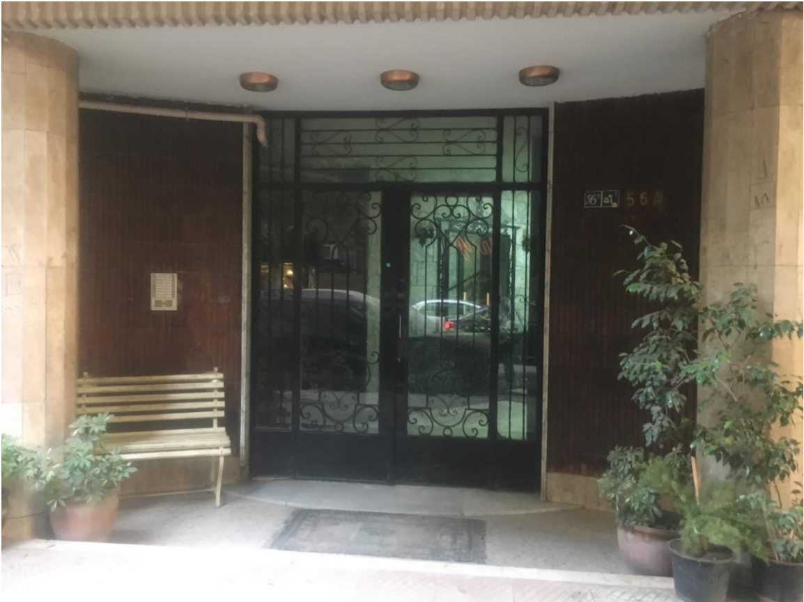
Entrance to Clem's apartment building