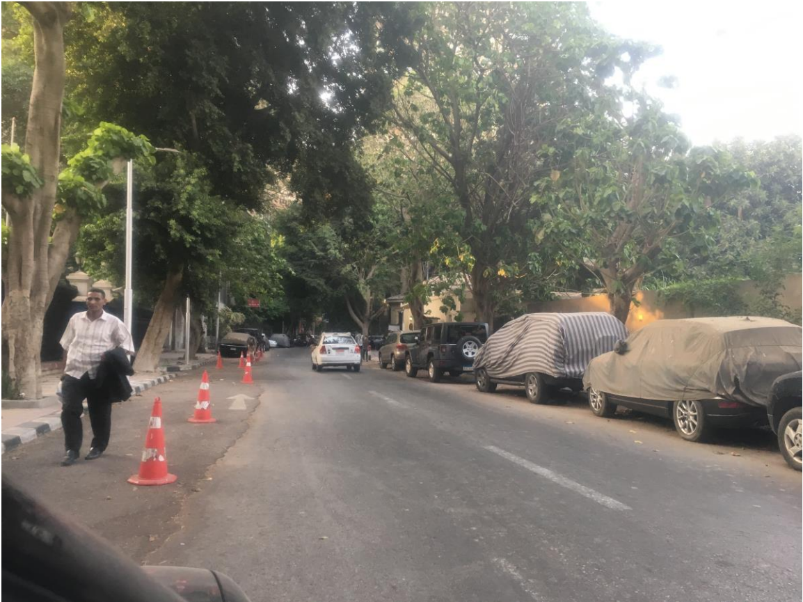
View of Mohammed Mazhar Street, Zamalek district, Cairo