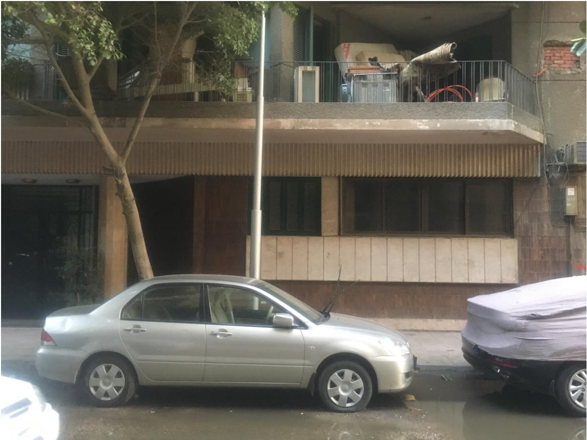
View of Clem's apartment on Mohammed Mazhar Street