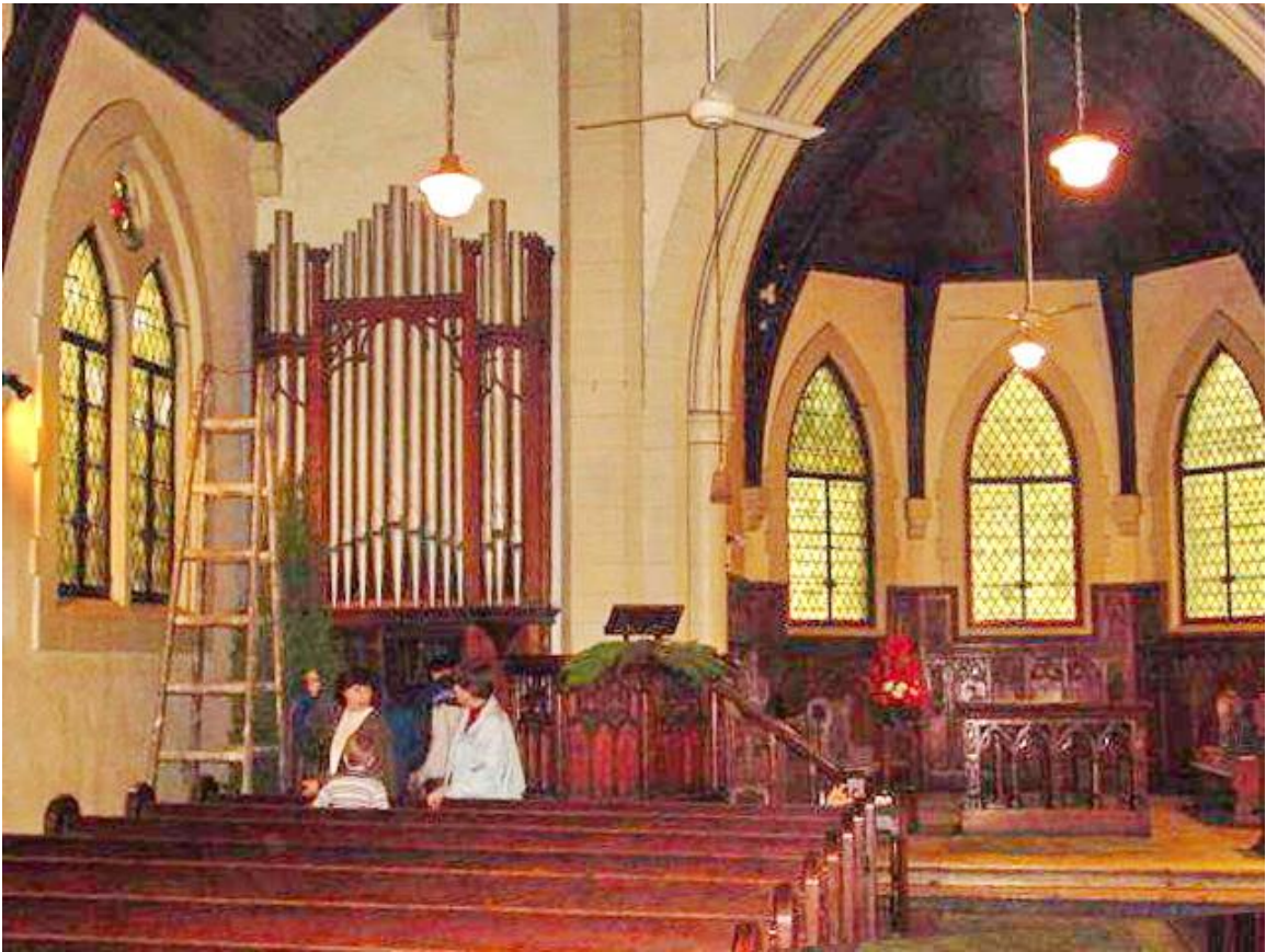
Interior, St. Andrew's Church