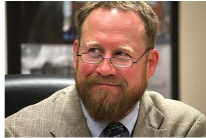
Guest Speaker in May!