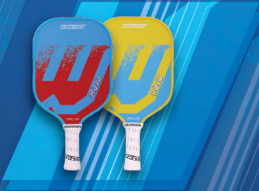
MOJO & DOJO