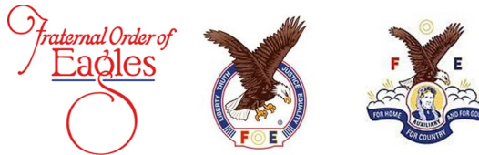
The Eagles Focus, Volume 2025, Issue 01