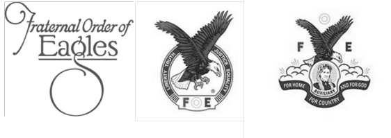
The Eagles Focus, Volume 2026, Issue 03