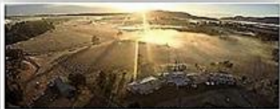
Glenguin Estate and Vineyard

997 Milbrodale Road Broke NSW 2330 Australia Phone: 02 6579 1009