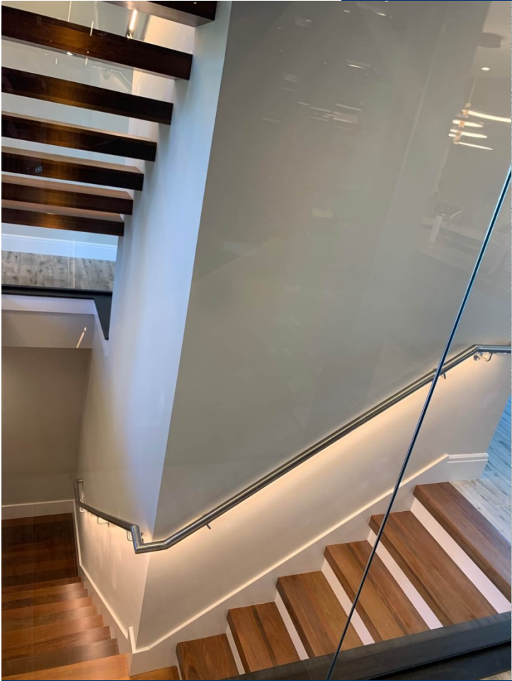
Form and Function

Elevolt's modular handrails are custom designed for your installation requirements. Our versatile rail system is designed for both illuminated and non-illuminated applications. With material options available in stainless steel 316 or 304.