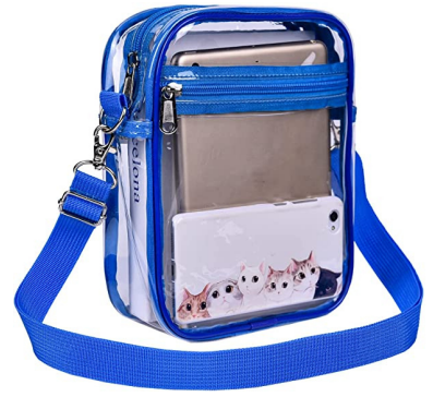
Rachel Clear Handbag in Blue HB-SB-RACH-BLU $12.25/$24.50