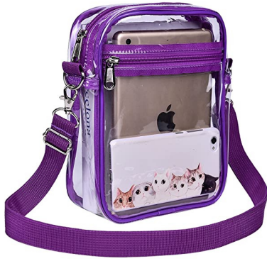
Rachel Clear Handbag in Purple HB-SB-RACH-PURP $12.25/$24.50