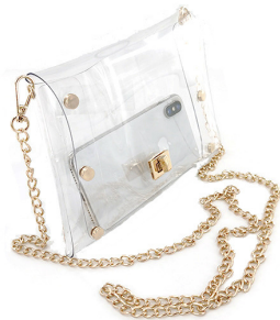
Phoebe Clear Handbag HB-SB-PHOEBE $16.47/$32.95