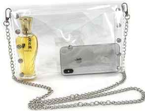
Selena Clear Handbag in Silver HB-SB-SELENA-S $16.47/$32.95