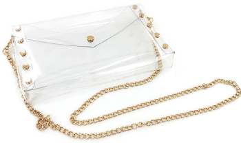
Selena Clear Handbag in Gold HB-SB-SELENA-G $16.47/$32.95