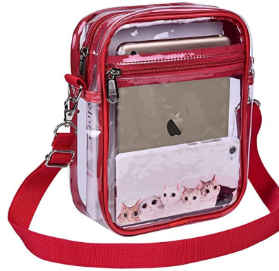
Rachel Clear Handbag in Red HB-SB-RACH-RED $12.25/$24.50