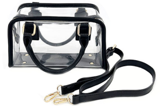
Jenn Clear Handbag HB-SB-JENN $18.47/$36.95