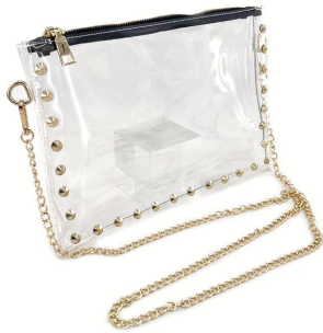
Gwen Clear Handbag HB-SB-GWEN $17.47/$34.95