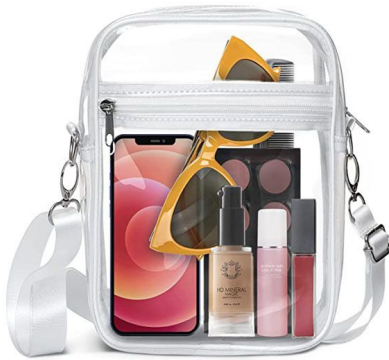
Rachel Clear Handbag in White HB-SB-RACH-WTE $12.25/$24.50