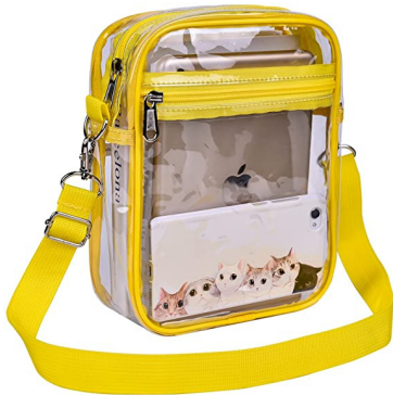
Rachel Clear Handbag in Yellow HB-SB-RACH-YELL $12.25/$24.50