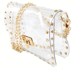
Harper Clear Handbag HB-SB-HARPER $21.47/$42.95