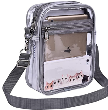
Rachel Clear Handbag in Grey HB-SB-RACH-GRY $12.25/$24.50