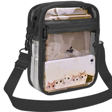
Rachel Clear Handbag in Black HB-SB-RACH-BLK $12.25/$24.50