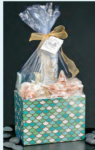
Ocean Gift Set OGS $25.00

Includes an 8oz. lotion, bar soap, sponge soap, flower soap, and a cupcake soap, all fragranced with lavender essential oil.