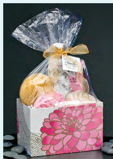
Plumeria Gift Set PLU-14 $20.00

It's a Boy or It's a Girl Gift Sets! These sets include an 8oz. goat's milk lotion, a Caribbean Silk facial sponge, a stamped soap and two soaps shaped like a rattle, bottle or baby carriage. All scented in a calming lavender fragrance. Perfect for that new mom!