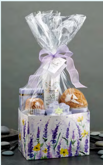
Lavender Dream Gift Set LDG $25.00

This gift box includes an 8oz. organic goat's milk lotion, an 8oz. goat's milk body wash, a goats milk soap and a natural facial sea sponge. Available in body wash fragrances on page 8.