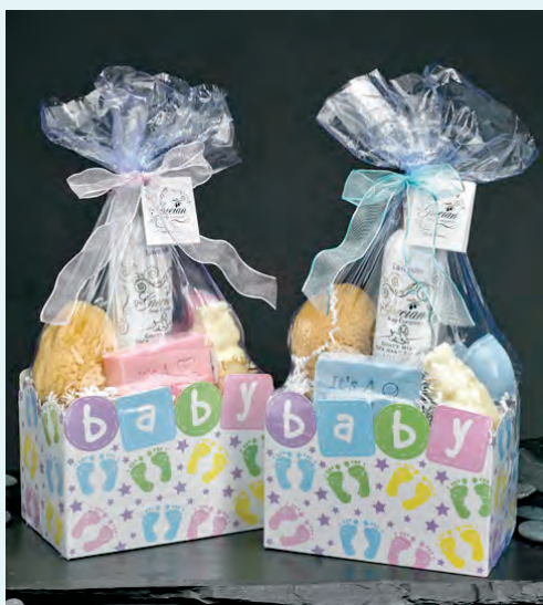
It's a Boy & It's a Girl Gift Sets IAB & IAG $17.00