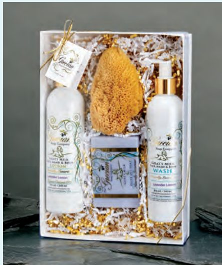
Lotion, Body Wash, Soap and Sponge Gift Set LBWS-xx $25.00

This gift box includes an 8oz. organic goat's milk lotion, an 8oz. goat's milk body wash, a goats milk soap and a natural facial sea sponge. Available in body wash fragrances on page 8.