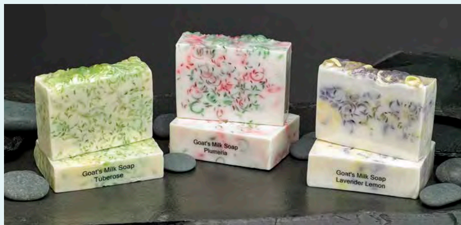
Summer Bloom Soaps

A great exfoliating bar using premium pink Himalayan Sea Salt in a goats milk soap base with our Island Citrus fragrance. 6oz. bars The ultimate bar for your feet!