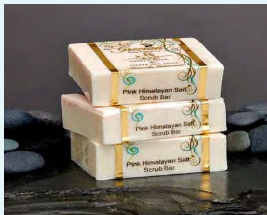
Pink Himalayan Salt Scrub Bar

One of our best selling bars! This soap combines 4 incredible ingredients that are great for your skin. 6oz. bars The ultimate bar for your face!