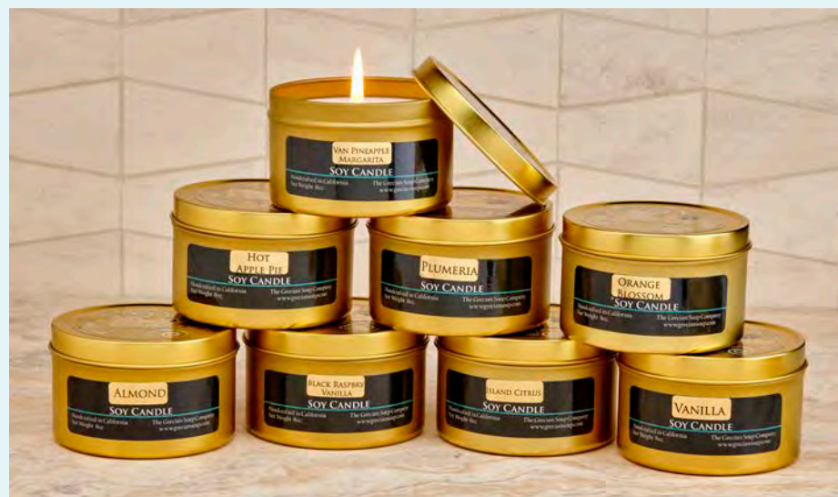
8oz. Hand Poured Soy Candles

Std. Pack is 4 ea. per fragrance. These soaps come in 3 different fragrances: Plumeria - 14, Lavender Lemon - 21 and Tuberose - 16