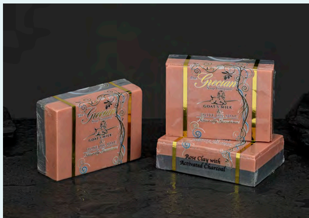
Rose Clay with Activated Charcoal Goat's Milk & Olive Oil Soap Bar