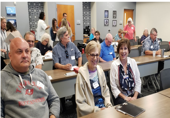
RCSSC members attended Foundation for Applied Conservative Leadership training.

The change would need voter approval because it would amend the Constitution. If approved it will be on the ballot in 2024.