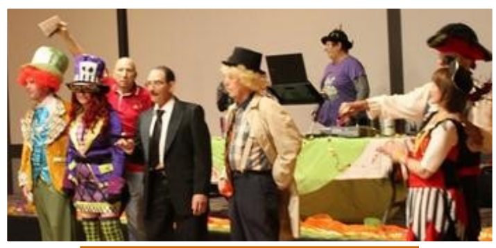
1st, 2nd, 3rd Place - Couple