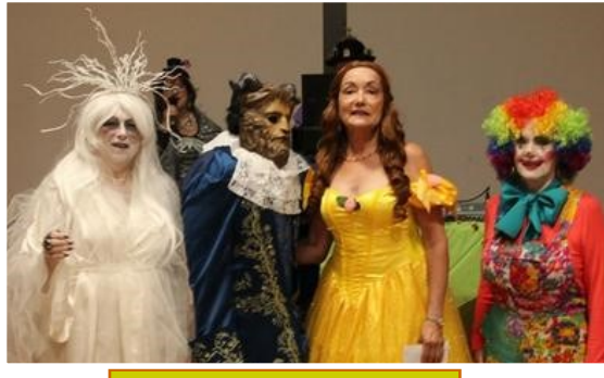
1st, 2nd, 3rd Place - Women