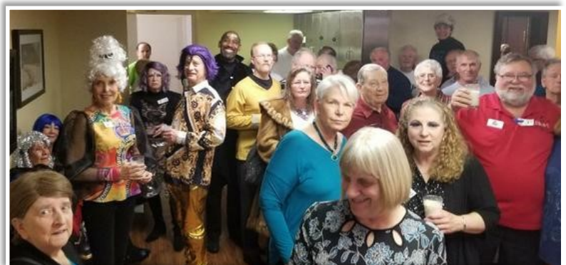
Members & guests enjoy the hospitality suite at MMATB 2020

Lights, camera, action, friendly banter, snacks, happy hour and music requests—what could be better!