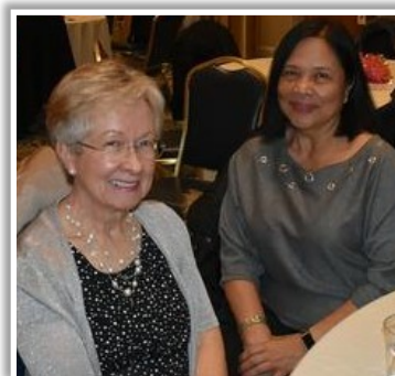
We welcomed new members to our club at MMATB 2020