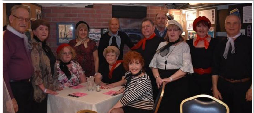
We welcomed new dance friends from Reading, PA at MMATB 2020