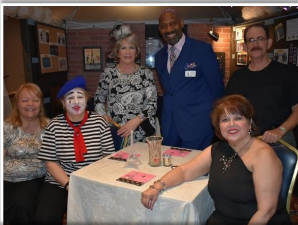
Board Members enjoy an Evening in Paris at MMATB 2020

If you haven't pushed the button yet, visit the club website and fill out the 2020 MMATB Survey.