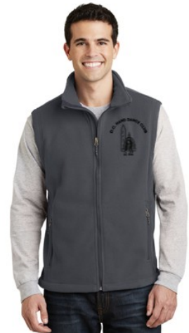
F219 Fleece Vest w/ zipper pulls & pockets in 6 colors