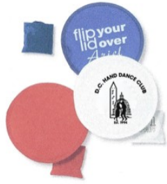
Hand Fan $2 each