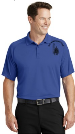
T475 Dri Zone polo, 9 colors incl. white.