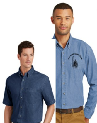
SP10-long sleeve SP11-short sleeve in faded blue & ink blue denim. Left chest pocket, button down collar.