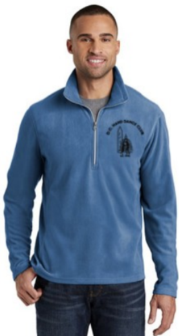
F224 Microfleece half-zip pullover in 4 colors.