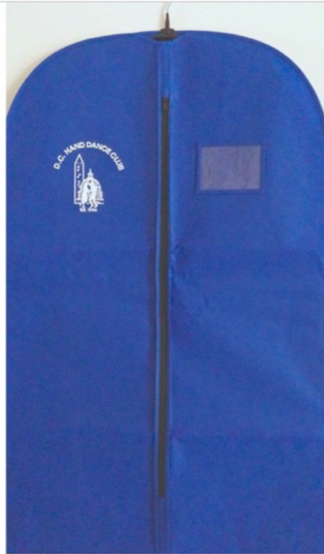
Garment Bag $8 each