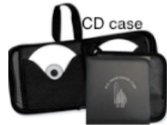
CD case including a cd w/music $3 each