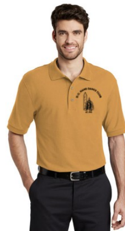
K500 This is a WOW Silk Touch polo available in 36 great colors. Name your color. Call for color chart.