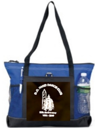
25th Anniversary TOTE BAG Only $10 each