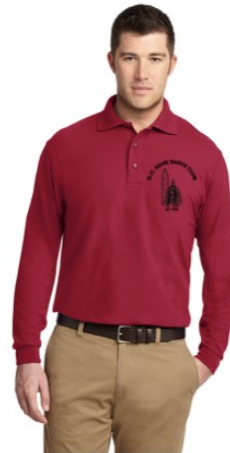
K500LS Silk Touch polo w/ side vents in 8 colors.