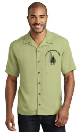
S535 Classic camp shirt w/ pocket, side vents in 4 colors