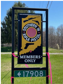
Pink flagging at entrance on IN-60

Key/Notes: The black area is the property boundary. The red areas are marked timber. The X'd areas have no marked timber. The black dotted line is the access road, and the yellow areas are potential yarding areas. Semi access is considered good. Only the timber boundary is flagged. The whole property boundary isn't flagged. Call David Cox (502) 802-6021 if you have questions.