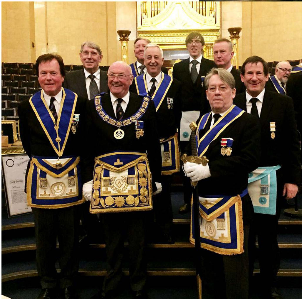
Left: Old Kimboltonians with the Provincial Grand Master.