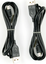
Cable USB 2.0