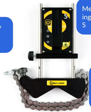
Measuring Unit S