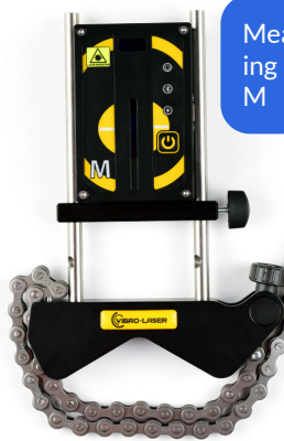
Measuring Unit M