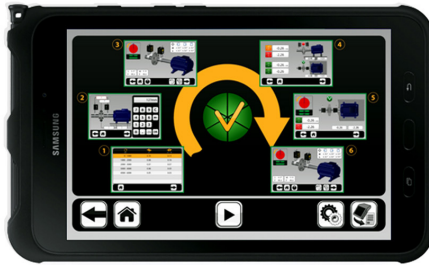
Galaxy Active Tab 2