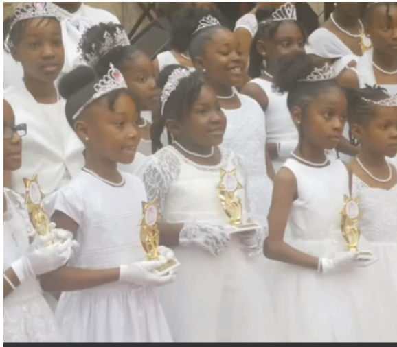
Purity Pledging Ceremony

Sexual Purity takes commitment and is a choice that allows you to keep yourself until marriage as a covenant agreement with GOD for His will to be accomplished in your life.