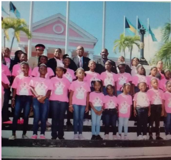
Princess Court at Government House - 2019