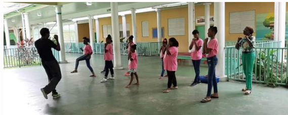
Self Defense Session