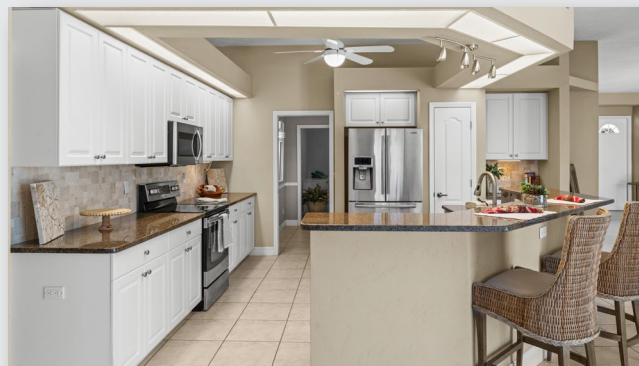
Spacious, well ordered kitchen with abundant counter and cabinet space