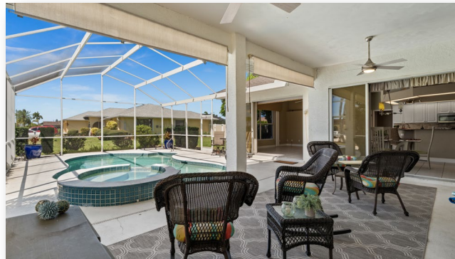
Covered lounge area, facing west over a private oasis