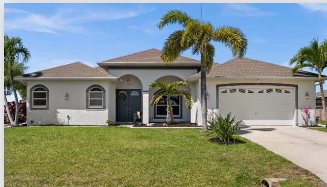
Why not make this slice of paradise your own?