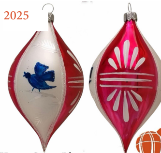
Winter Songs Blue