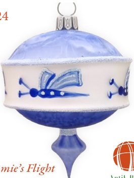
Tammie's Flight 3.25" X 2.5"