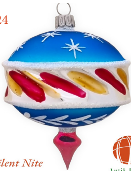
Silent Nite 3.25" X 2.5"