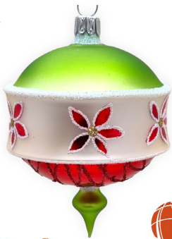
Christmas Rose 3.25" X 2.5"