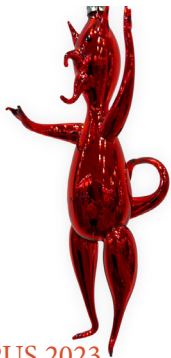
KRAMPUS 2023 6" T