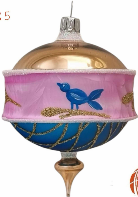
Bluebird Song 3.25" X 2.5" $55