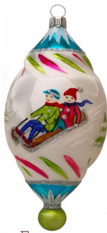
Schnee Fun 4.25" T