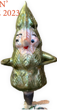
4.25" T $68