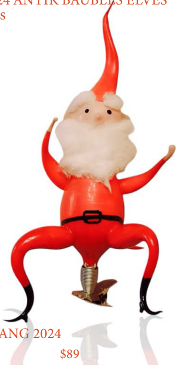
CLANG 2024 4.25" T $89