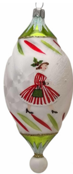
City Sidewalks 4.25" T