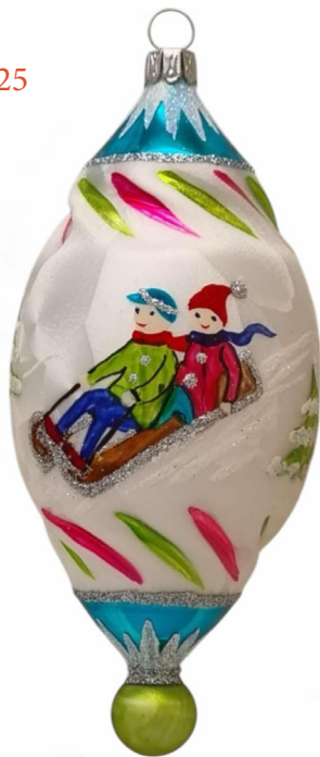
Schnee Fun 4.25" T $68