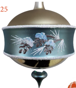
Waldfrost 4.25" T