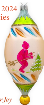
Winter Joy 4.25" T