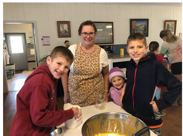
Pumpkin bread baking on Thanksgiving Sunday. Yum!