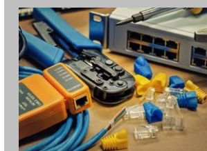
RJ CRIMPING TOOL