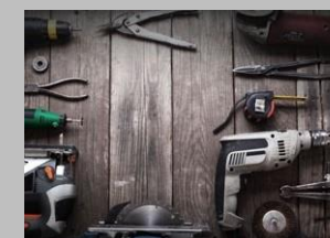
DRILL MACHINE & ACCESSORIS