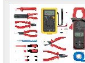
ELECTRICAL TOOL KIT