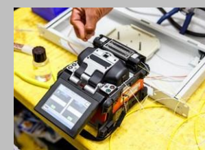
FIBRE OPTICS SPlicing MACHINE