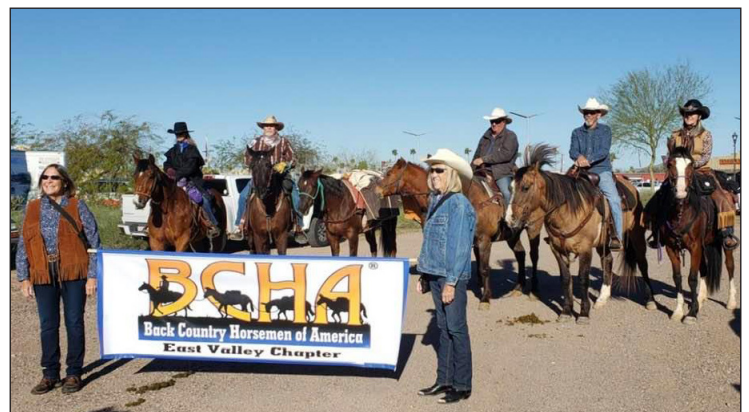
Displaying our chapter banner in the The Lost Dutchman Parade 2019