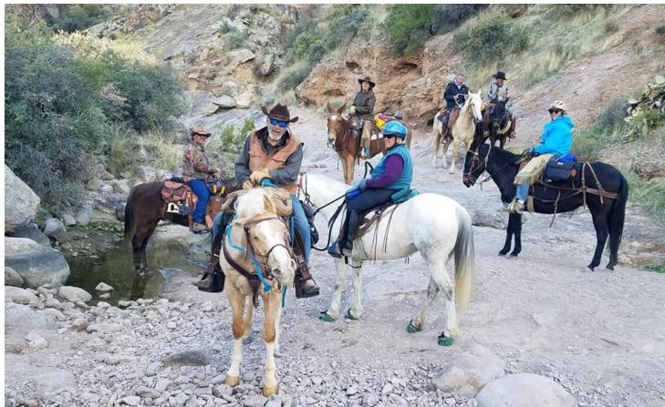
Work crew coming back from a Work Project in the Grotto Area of the Dutchman Trail. 2021

In the 2021 season, we were able to successfully recon all 14 trails in our Forest Service Agreement and had 4 productive work parties. The trails focus last year was to complete recons of all of our 14 trails. That was accomplished.