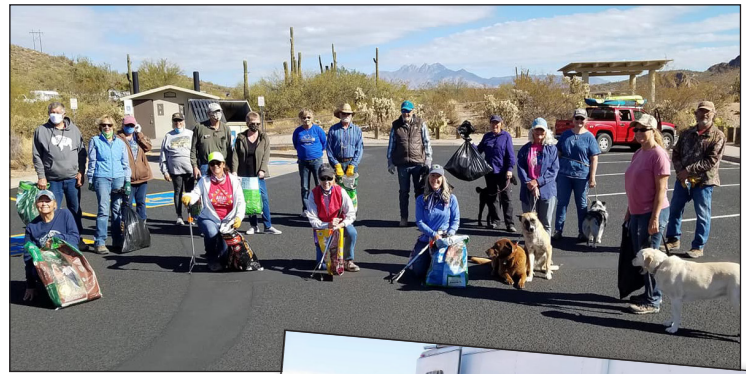
Last season, 20 members participated in the Water User's Parking Area Cleanup.

Once Liability Insurance is secured the EVBCH Festival will take place January 29th and 30th 2022 at the Apache Junction Rodeo Grounds. We need volunteers to help with the activities! To volunteer, get a full schedule and more information on the festival contact Shirley Righi at: srighi76@gmail.com or text (602) 931-0929.