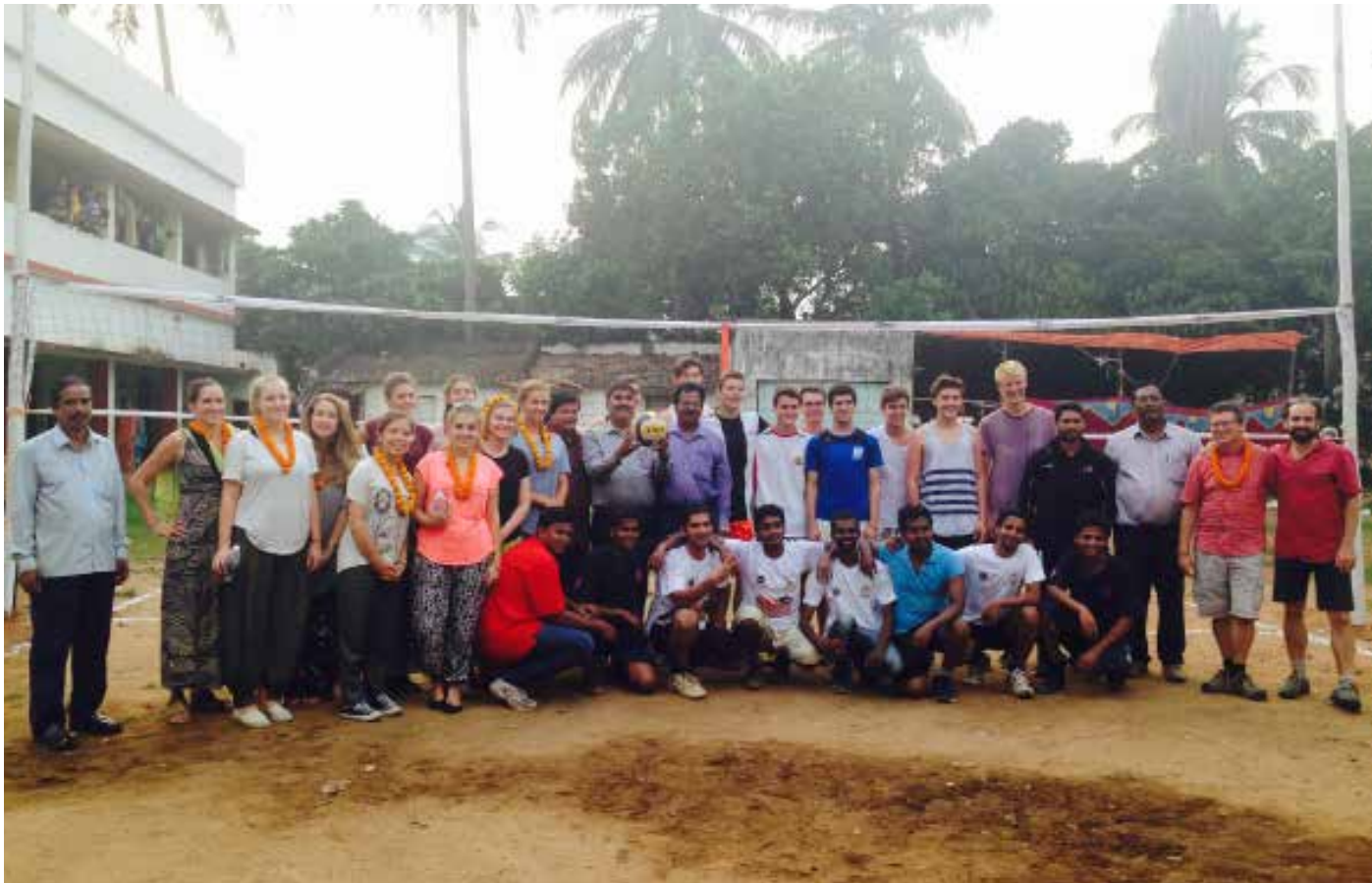
Volley Ball match between YMCA & ISZL students / Candle lighting in support of sustainable development goals under the campaign 2015 / Painting to personally express ourselves / Intercultural food exchange : Meet & learning / Orissa dance