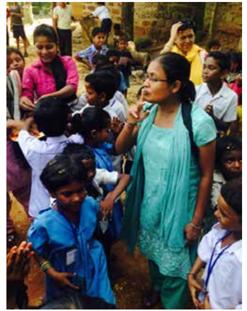
Visiting the kids School at Banafulla slum school. The welcome presentation which included songs & dances by the children. Playing games with the children & meeting the slum people.