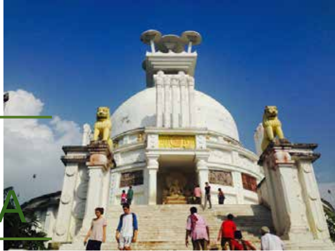
Visiting the Peace Pagoda Temple / Buddhist Temple Located in Darjeeling