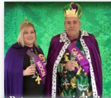
Put your name in the box @ site #36 to be the 2019 "King Cake" or "Queen Moon Pie" Only Campers are eligible.

Parade will roll around the campground 2 times. All golf cart rules apply. Licensed driver and proof of liability insurance is MANDATORY. Loud music WILL only be allowed during the parade.