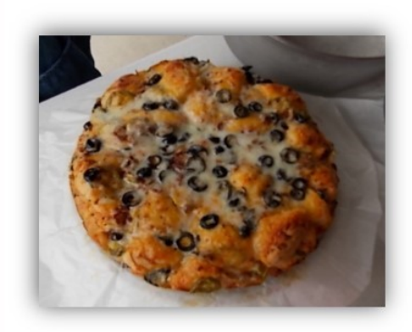
Meeting, Greeting, Cooking & Eating

Latanier Cookers (lah ton ya) will be hosting a D.O.G. (Dutch Oven Gathering)