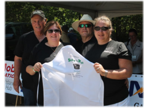
3rd Place - Seafood Pistolettes Camping Family