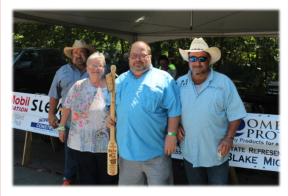
2nd Place - Venison Cajun Spaghetti Meaux Brothers