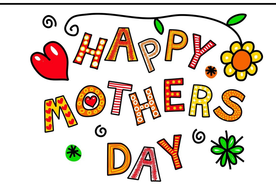
Sunday, May 12th is Mothers Day. Friends of Palmetto would like to wish all the Mothers a very happy Mothers Day.