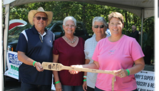
2nd Place - Crawfish, CrabMeat Eggplant Beignetw/ Remoulade SauceConcepts of Care Home Health