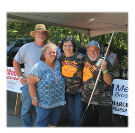
1st Place - Wild Hog Chili Kraze Kajun Kookers