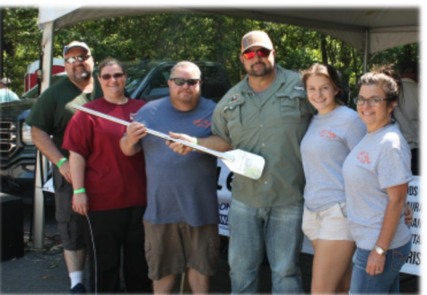
1st Place -Crawfish a La Chauze Crazy Cajun Lawn Care