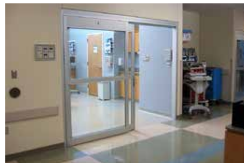
GT2125 ICU Door