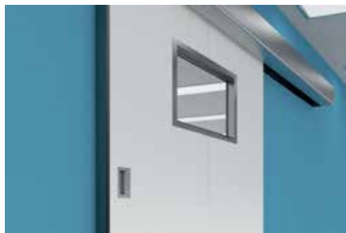
GT9000 NAX Hermetic Door