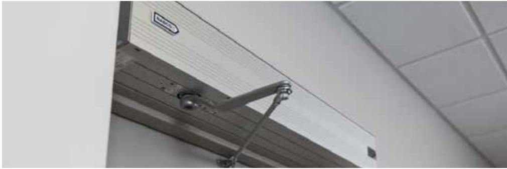
GT8500 Sideload, Outswing