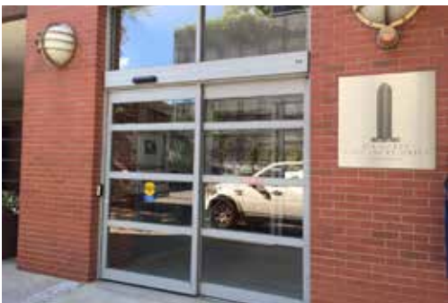
GT1175 Single Sliding Door