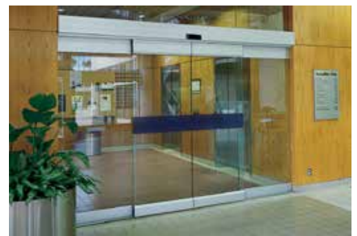
GT1175 Bi-Part Glass Sliding Door