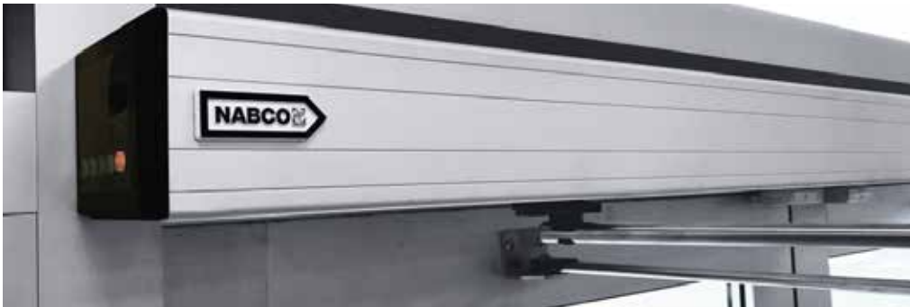
GT20 Simultaneous Pair