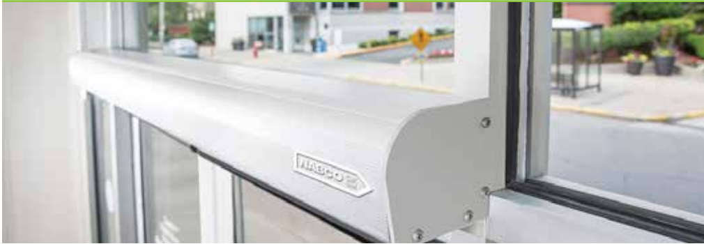
GT710 Curved Header Sideload, Outswing