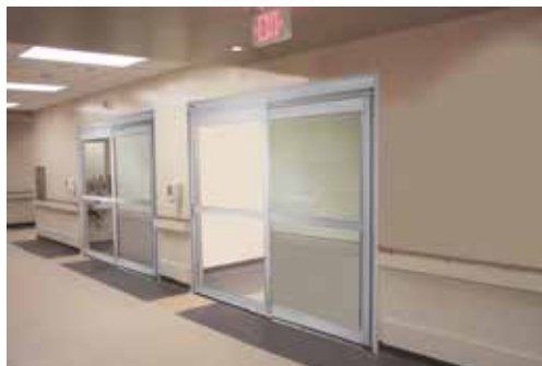
GT2400 ICU Door