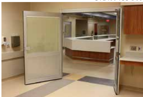
GT2300 ICU Door