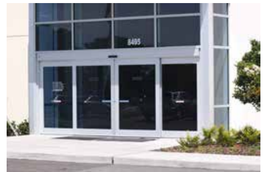
GT1175 Hurricane Sliding Door