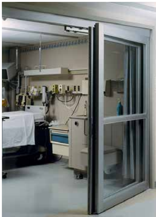
GT2100 ICU Door