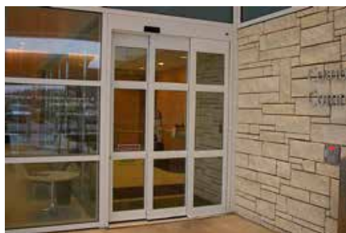
GT1175 Single Telescopic Sliding Door