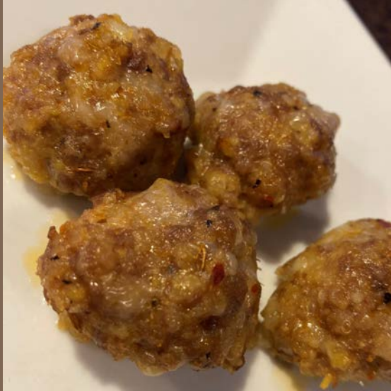
Recipe adapted from Cooking Light Nov 2014

Whole grains. Dairy. Protein. These freezer friendly balls are a great make ahead lunch. Serve them with a dip for younger kids or as a slider for older kids.