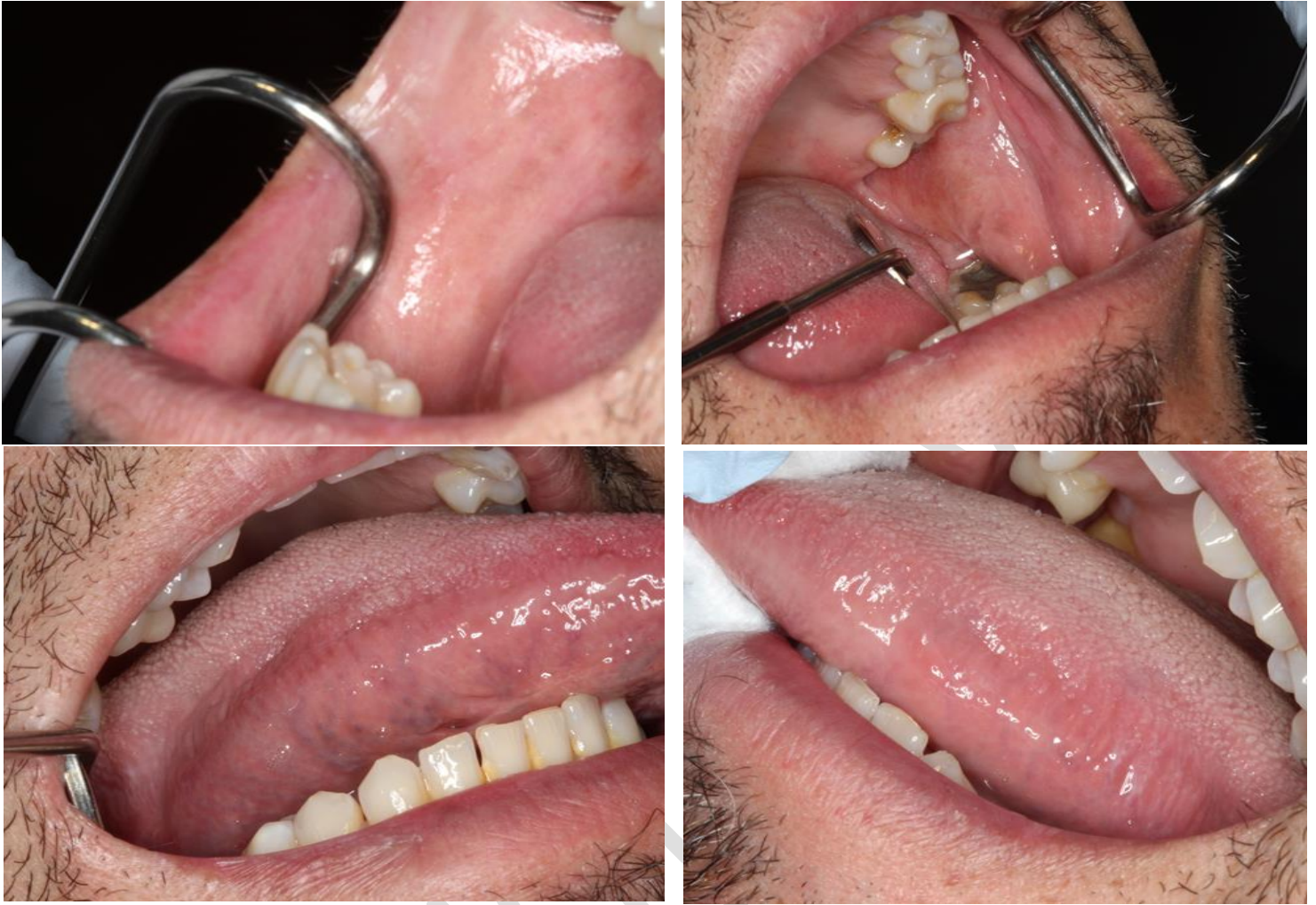
Figure 2. 2-month review, right and left buccal mucosae and lateral borders of the tongue. Faint striation and inflammatory hyperpigmentation on the left buccal mucosa, and complete resolution of tongue lesions.