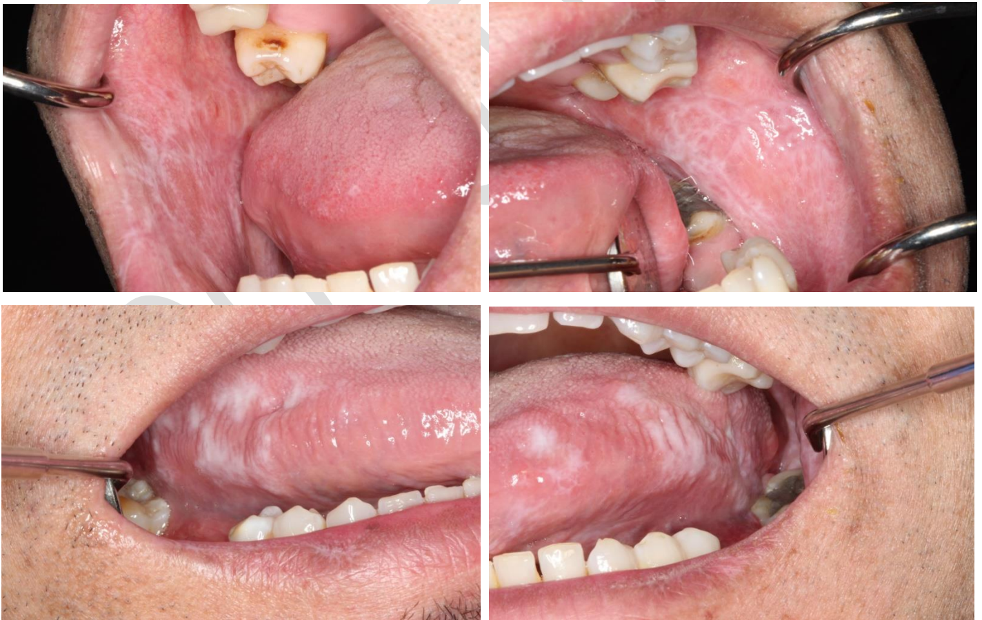
Figure 1. Initial presentation, right and left buccal mucosae and lateral borders of the tongue.