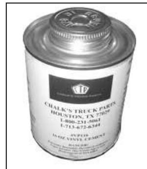
Chalk's Part #: VP116 Vinyl Cement