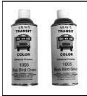
Vinyl Color Spray All Colors - See Inside Back Cover for Colors