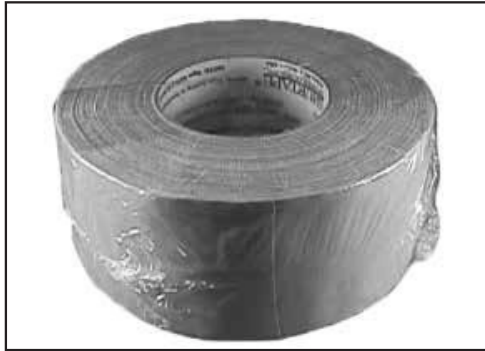
Chalk's Part #: M-360 (Maroon) BL-360 (Blue) S-360 (Silver/Gray) Tape 3" X 60 Yards B-360 (Brown) BLA-360 (Black) G-360 (Green)