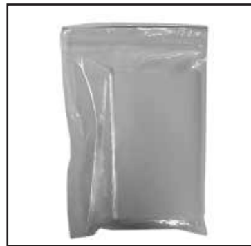
Chalk's Part #: 111 12" x 54" Mesh Material To Repair Cuts