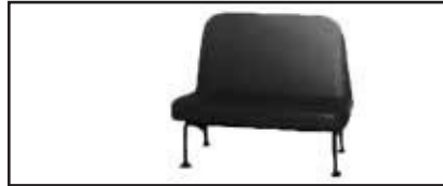
Seat Covers, Backs, and Cushions

CALL - WE WILL BUILD THE PART NUMBER FOR YOU