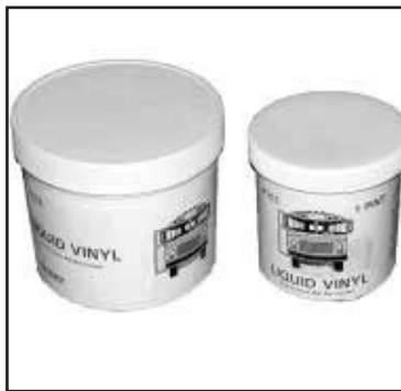
Chalk's Part #: VP16 1 Pint Chalk's Part #: VP32 1QT Liquid Vinyl Compound