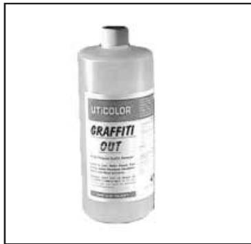
Chalk's Part #: GWB10-Q Uticolor Graffiti Out