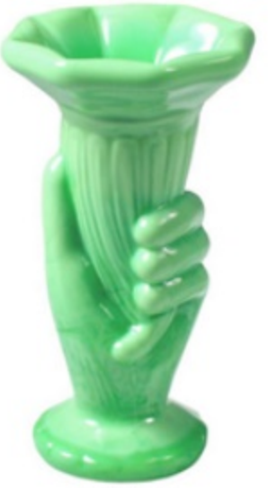
Z5153XE 3-1/2" Mini Chameleon Green Hand Vase, $49.50, <u>Buy Now!</u>

Hand vases have always been sought after by collectors and this Mini Chameleon Green Hand Vase is a must have. Very limited quantities have been produced of this new Gift Shop Exclusive.