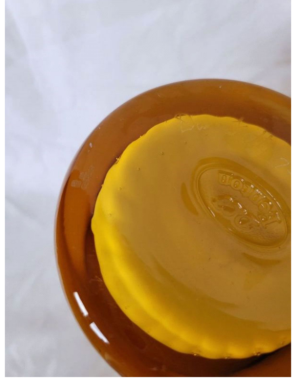
Have you heard of Fenton-opoly?