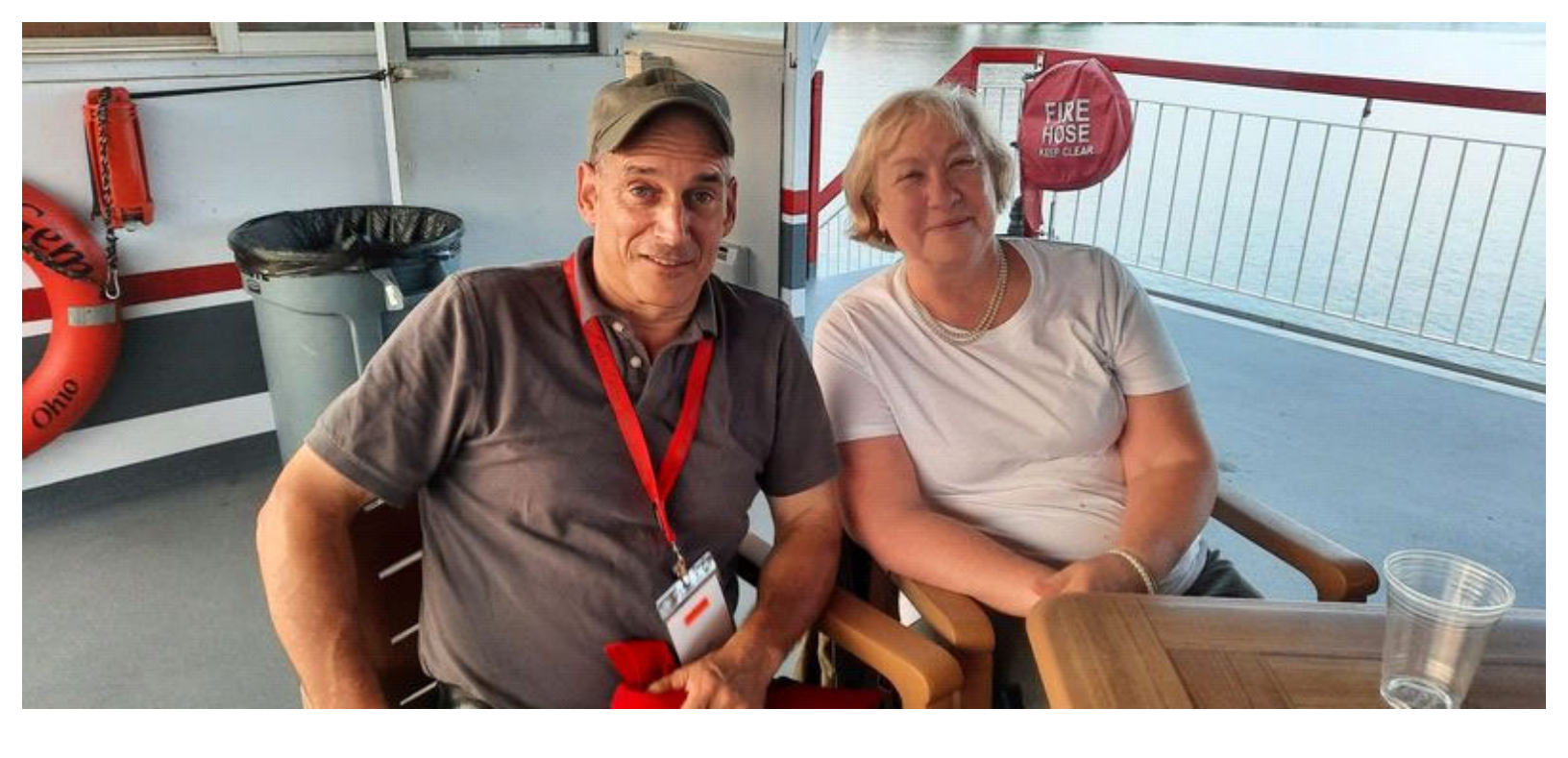
My Convention Find for 2024 By Ellen Stohler