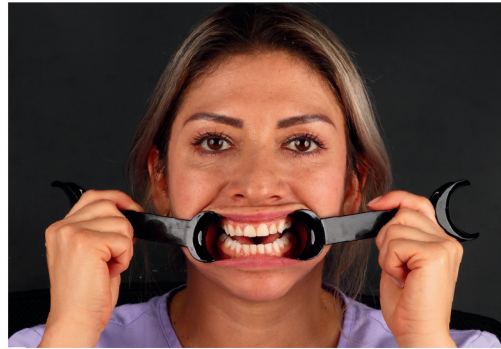
Step 5: Retracted Teeth Apart