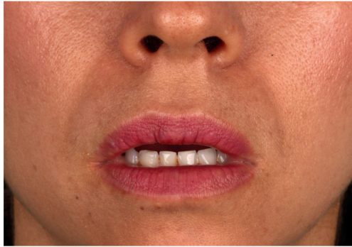
Step 2: Full Face With Repose Smile Close Up