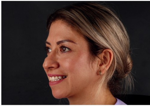
Step 4: 45 Degree Profile View Left