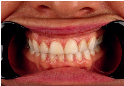
Step 7: Retracted Full Face Close Up