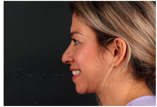
Step 6: Left Profile View