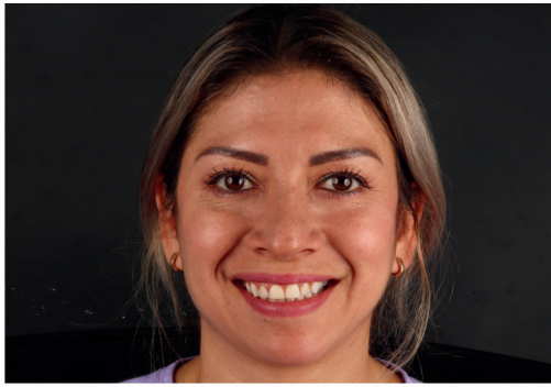
Step 1: Full Face With Exaggerated Smile