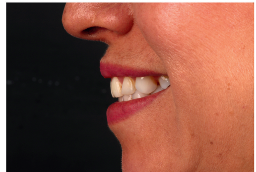
Step 6: Left Profile View Close Up