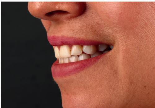
Step 4: 45 Degree Profile View Left Close Up