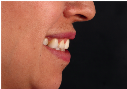
Step 5: Right Profile View Close Up