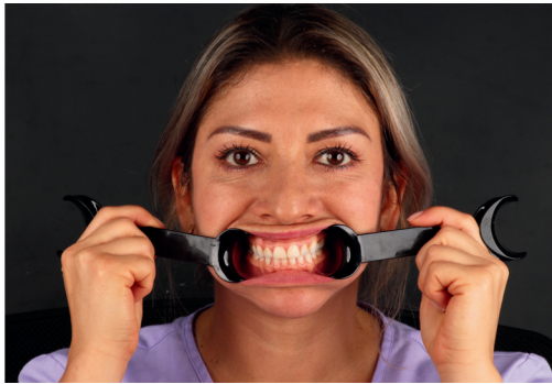
Step 7: Retracted Full Face