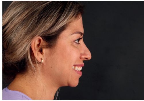
Step 5: Right Profile View