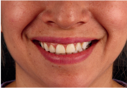
Step 1: Full Face With Big Smile Close Up