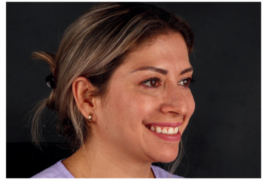
Step 3: 45 Degree Profile View Right