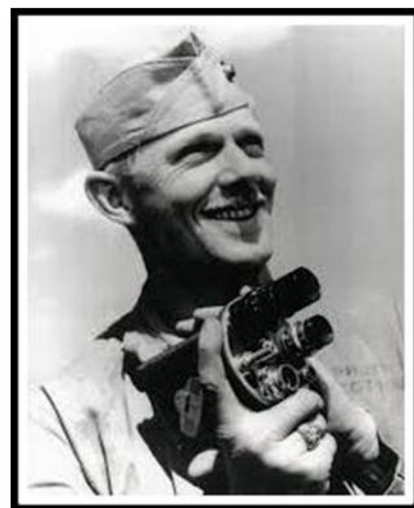
The Bell & Howell Auto Master