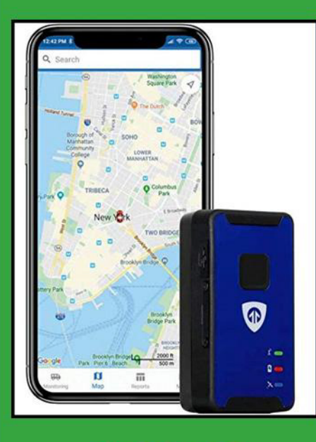
Spark Nano 7 4G GPS Tracker