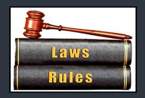
INVESTIGATIVE REPORTS TO CUSTOMERS

Title 16. Professional and Vocational Regulations