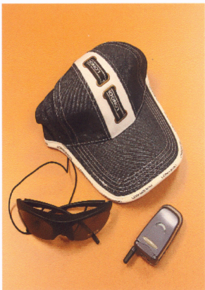
Covert Hat Camera, Cell Phone camera and Sun Glasses camera. All record to a remote Digital Video Recorder (DVR) with Date & Time stamp.