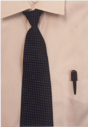
Covert Neck Tie Camera and covert Ink Pen Camera. Both cameras record to a remote Digital Video Recorder (DVR) with Date & Time stamp.