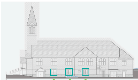
Proposed Restored Windows Similar on the building North side

We only have 2 months to go for Project Advance 2024! Thank you to all who have donated so far. The percentage of parishioners donating is steadily climbing and that is wonderful to see! Donations are accepted until the end of the year and are tax receiptable. To donate, go online to our parish website at ourladyoflourdescoquitlam.ca/donate , drop your well-marked donations in the collection basket or call the Project Advance Office at 604-683-0281.