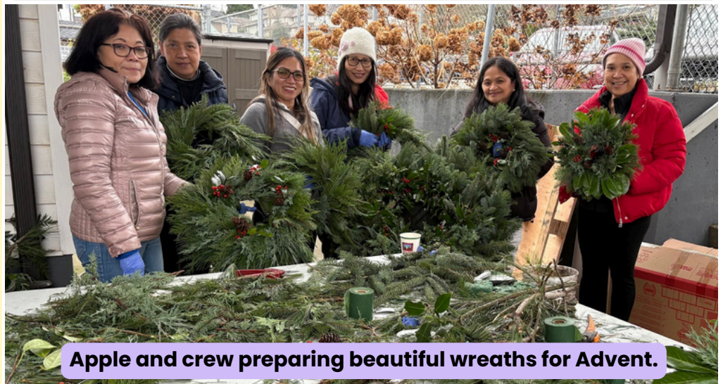
Apple and crew preparing beautiful wreaths for Advent.