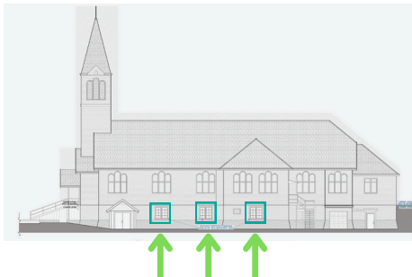
Proposed Restored Windows Similar on the building North side

Did you know that Project Advance has helped fund important parish projects, social justice initiatives, Catholic schools, prison ministry, chaplaincy at our hospitals and more for over 40 years? Many services the Church provides are not in the forefront of our mind until we need them, having a hospital chaplain, for example, when our loved is near death. Of course, Project Advance also helps fund our projects at Our Lady of Lourdes. We are so grateful for all the donations which will help fund new windows as part of our basement renovation. You can donate online through our website at ourladyoflourdescoquitlam.ca/donate , drop your well-marked envelope in the collection basket or at the parish office, mail your donation directly to the archdiocesan Project Advance Office or call the archdiocese at 604-683-0281.