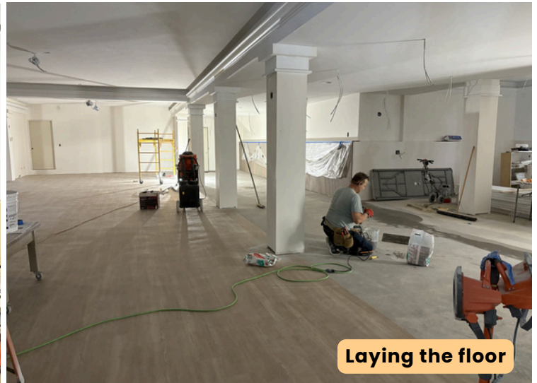
Laying the floor

The Ignatian Spiritual Exercises provide us with the necessary tools to discern spirits and recognize God's will for our sanctification in our everyday lives. The Ignatian Weekend Silent Retreat is a modified version of the Spiritual Exercises following St. Ignatius' 18th Annotation guidelines. All are welcome! On Friday, December 5 through Sunday December 7, at Westminster Abbey in Mission. Learn more and register at beholdvancouver.org/events .