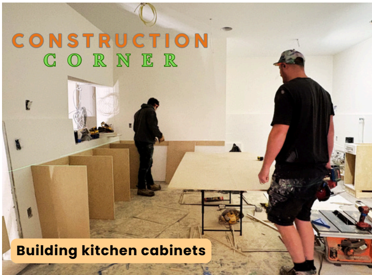
Building kitchen cabinets

Eternal Father, I offer Thee the Most Precious Blood of Thy Divine Son, Jesus, in union with the Masses said throughout the world today, for all the holy souls in purgatory, for sinners everywhere, for sinners in the universal church, those in my own home and within my family. Amen. (Prayer of St. Gertrude)