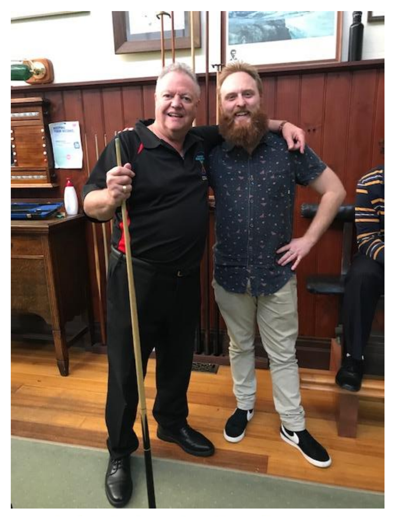
North Brighton Club – Encouraging Snooker, Billiards, and Friendship since 1911

"Snooker, Billiards, Friendship" ABN 44 870 849 458