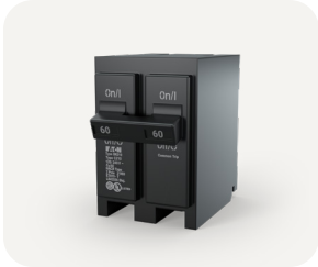
BRK-125A-2P-240V Main Breaker, 2 pole, 125A, 25kAIC, CSR2125N for IQ System Controller.