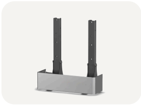
B05-PI-0550-O Floor mount pedestal for IQ Battery 5P.