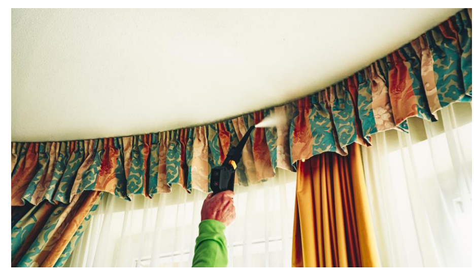
Ecological and efficient cleaning without chemicals!