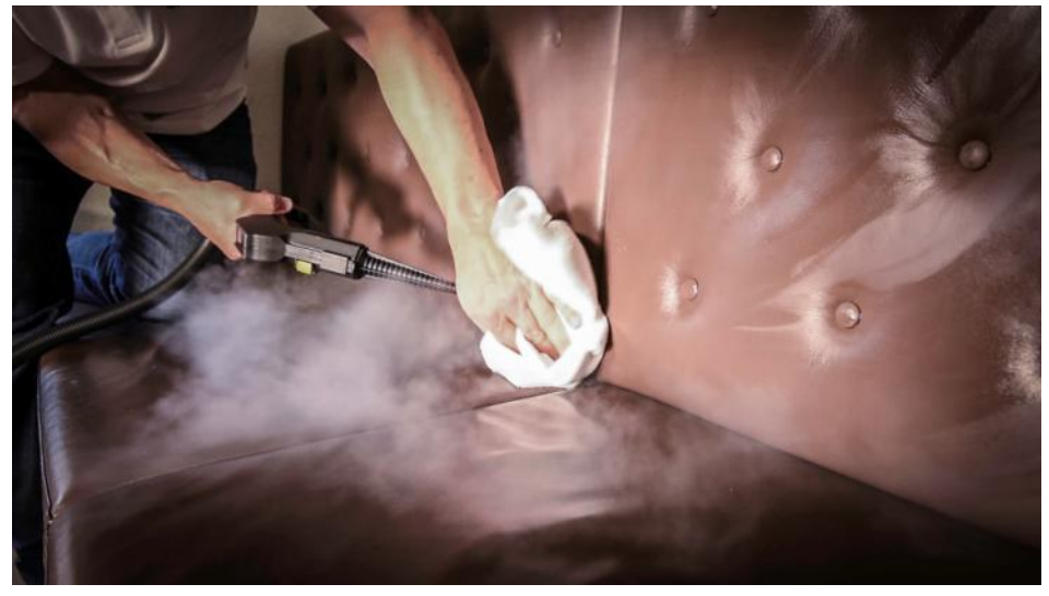
Ecological and efficient cleaning without chemicals!