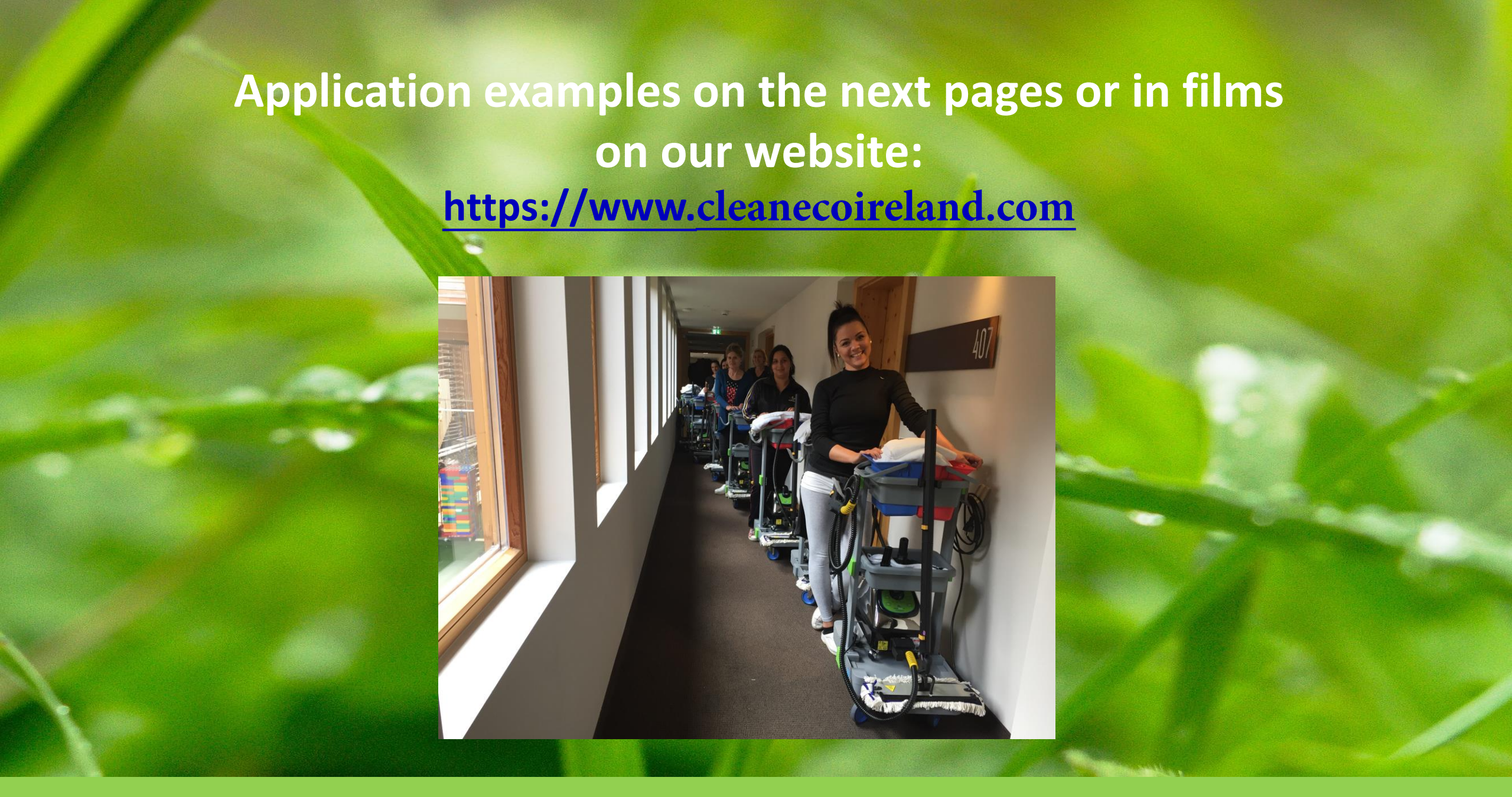
Ecological and efficient cleaning without chemicals!