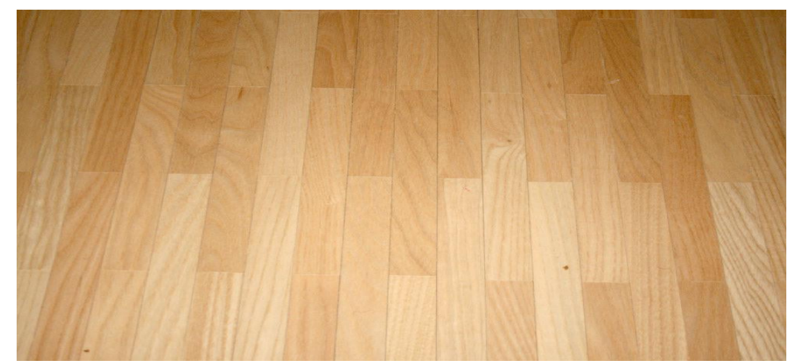
Ecological and efficient cleaning without chemicals!