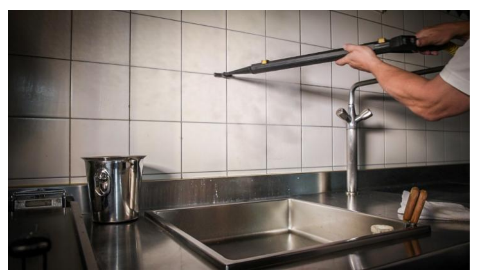
Ecological and efficient cleaning without chemicals!