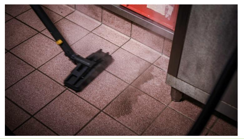
Ecological and efficient cleaning without chemicals!