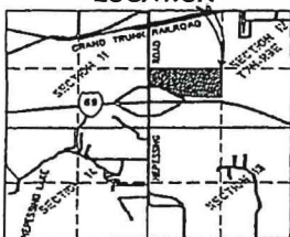
LOCATION MAP NO SCALE